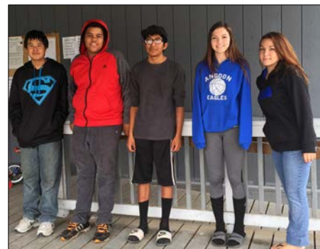
Angoon YES Participants

The success of the summer program would not have been possible without the tremendous support from host-employers, supervisors who trained and mentored, community coordinators who offered guidance and support, and parents/caregivers who created supportive environments for our participating youth.