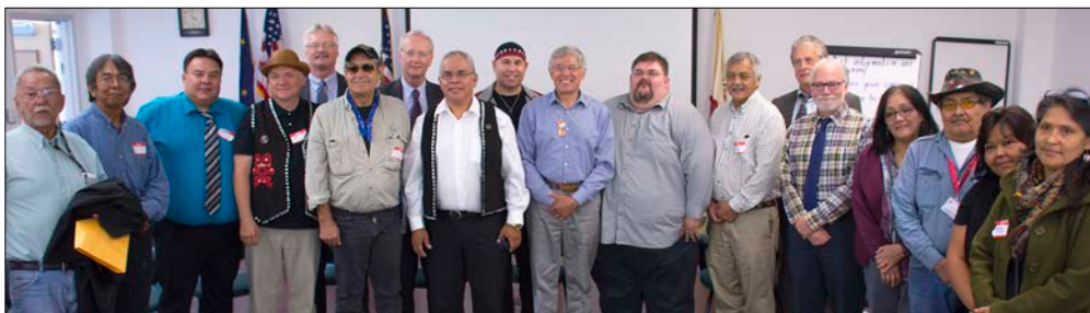
Participants in the state-tribal meeting on transboundary mining.

On August 5, 2015, Lt. Governor Byron Mallott, along with key cabinet members and senior staff from the departments of Natural Resources, Fish and Game, and Environmental Conservation, met with Southeast Alaska tribal representatives in Juneau, Alaska to discuss the large-scale mining development effort taking place on transboundary rivers in northwest British Columbia which flow directly into our Southeast Alaska waters.